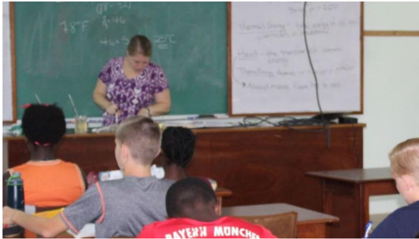
Impacting hearts in the classroom at Rain Forest International School.

In This Edition: News of Security Incident